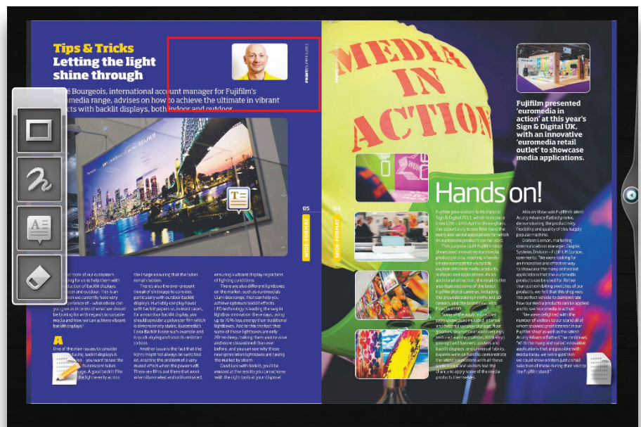
Annotation tools within XMF Remote allow collaborative review of jobs in progress between multiple users on any supported platform.

XMF Remote supports Apple iPads and Android-based tablets, allowing customers to log in, view, annotate and approve jobs from virtually anywhere. For the iPad there is a dedicated app available as a free download from the iTunes App Store; for other mobile devices, a rich HTML5 mobile interface is provided within XMF Remote.