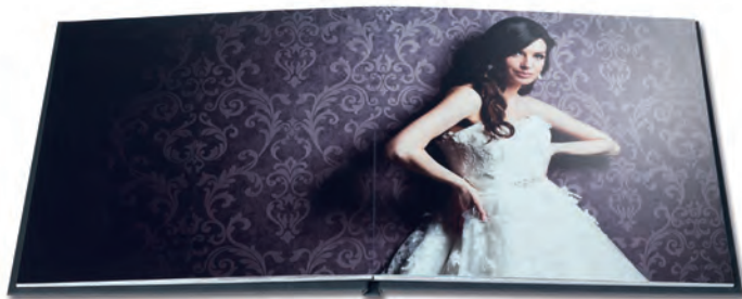
Photo albums in various sizes and outstanding thickness