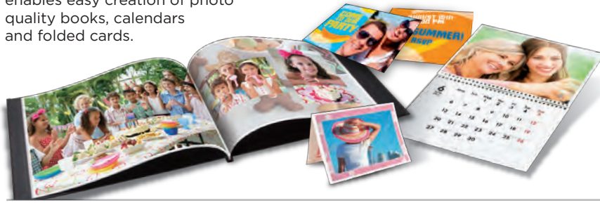
PHOTO BOOKS, CALENDARS AND FOLDED CARDS CAN BE EASILY CREATED ON-SITE

Automatic double-sided printing enables easy creation of photo quality books, calendars and folded cards.