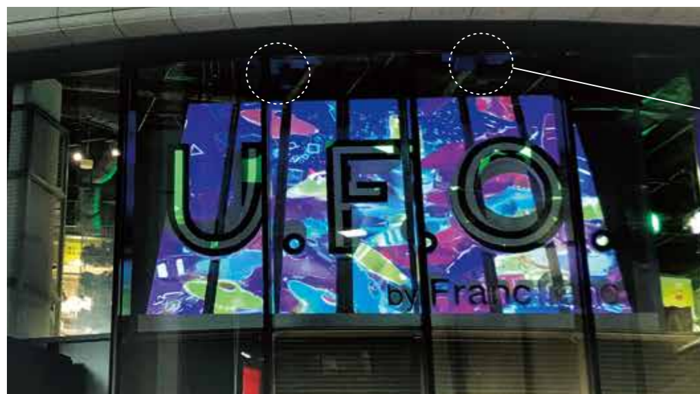
U.F.O. by Francfranc LINKS UMEDA