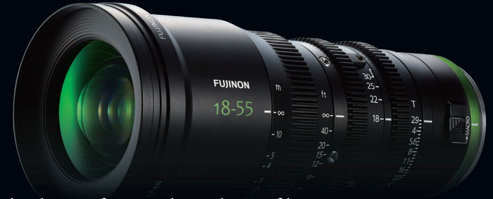
Image expression moves into a new era, thanks to the unique optical technologies of cinema lenses by Fujifilm