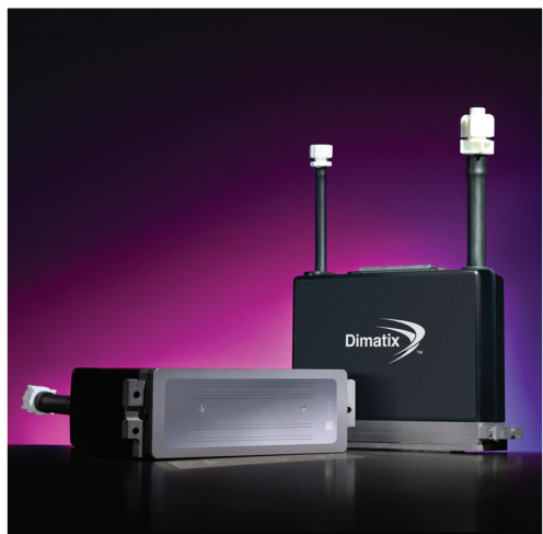
StarFire SG1024 1C Ceramic Printheads