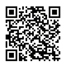
Scan to learn more!