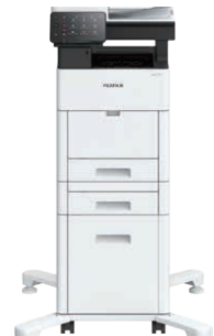
Main unit + 550-Sheets Feeder x1 + High Capacity Feeder