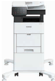
Main unit + Cabinet