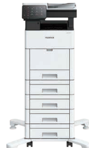
Main unit + 550-Sheets Feeder x4 + Caster