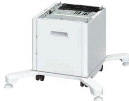
High Capacity Feeder