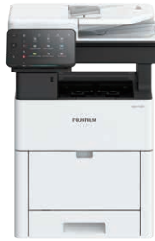
Apeos C5240 Model-CPS