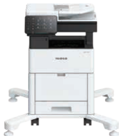
Main unit + Caster