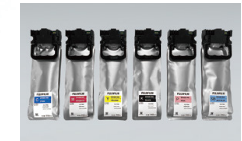
6-ink system C M Y K + SB (Sky Blue) + P (Pink)

The Frontier DX400W uses a proprietary Fujifilm 250ml high-capacity, cartridge-free, 6-ink system. This helps reduce waste when compared to traditional cartridge systems.