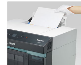
Manual feed unit