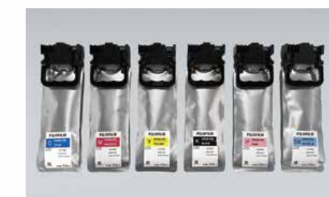
6-ink system C M Y K + SB (Sky Blue) + P (Pink)

The Frontier DX400W uses a proprietary Fujifilm 250ml high-capacity, cartridge-free, 6-ink system. This helps reduce waste when compared to traditional cartridge systems.