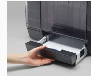
Sheet feeder (optional)

Another significant distinguishing characteristic of the Frontier DX400W is its ability to print not just on roll paper, but also on flat sheets. The Frontier DX400W supports single-sided printing for tremendous versatility. Use the manual feed unit for smaller print runs or the optional sheet feeder to load up to 100 sheets for higher volume environments. Please note that the optional sheet feeder is sold separately and does not come in the package with the Frontier DX400W.