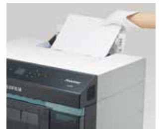
Manual feed unit